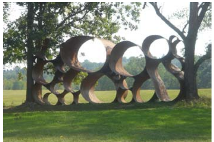
Sculpture by DeWitt Godfrey