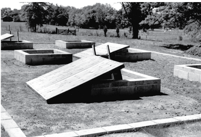
Sculpture by Alice Aycock