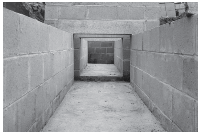
Sculpture by Alice Aycock