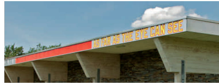
Lawrence Weiner, AS FAR AS THE EYE CAN SEE, 2008

The Charles B. Benenson Visitors Center and Gallery welcomes local residents and visitors from afar to The Fields Sculpture Park at Omi International Arts Center, (Art/Omi). Entrance to The Fields Sculpture Park is free and open to the public year-round.