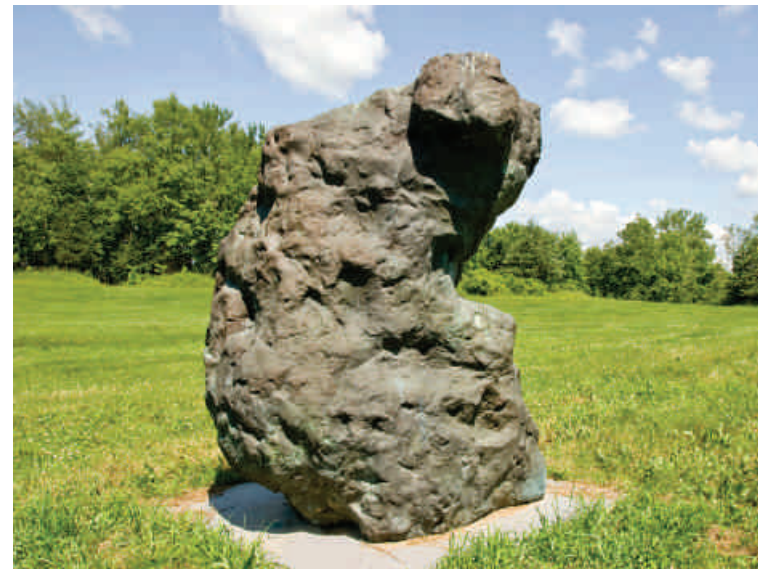
William Tucker, Eve , 2000

The Gallery provides a unique situation for indoor exhibitions, concerts, lectures, readings and dance recitals; drawing a selection of the participants from the internationally competitive Omi Residency Programs. The Visitors Center is available for private events and benefits. Our Café serves delicious local and seasonal food during the summer and fall, while a more limited menu is available for those who choose to enjoy our groomed cross-country ski trails during the winter months.